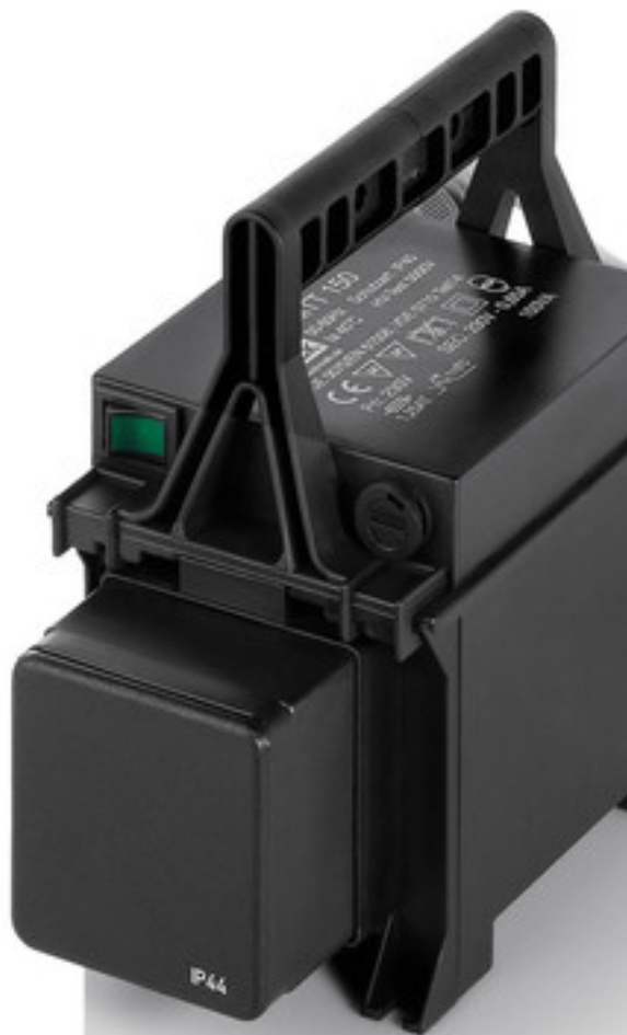
Picture shows SMTT 150