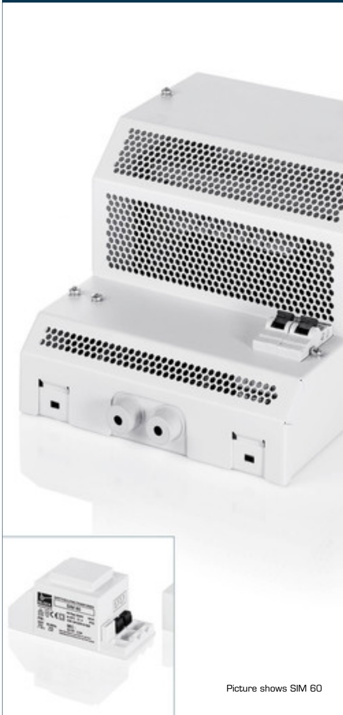
Picture shows SIM 60