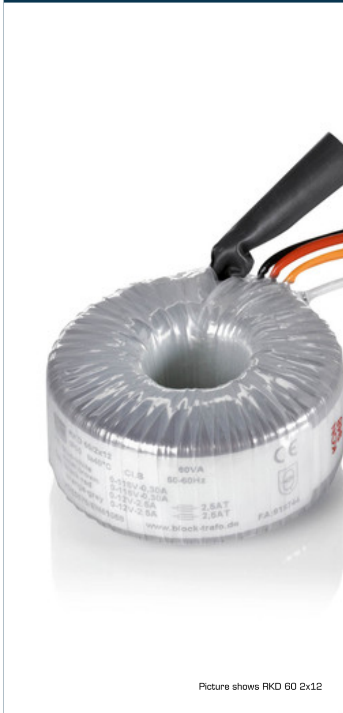
Picture shows RKD 60 2x12