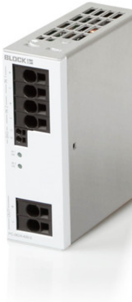
Picture shows PC-0624-400-0