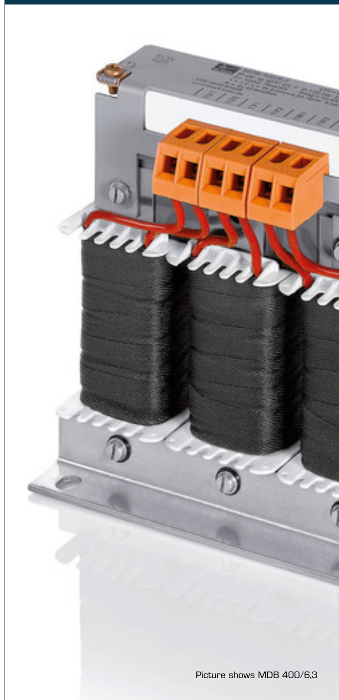
Picture shows MDB 400/6,3