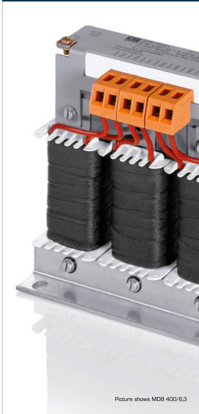
Picture shows MDB 400/6,3