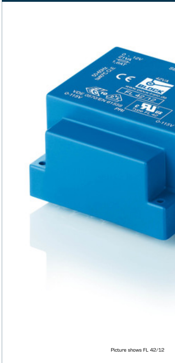
Picture shows FL 42/12