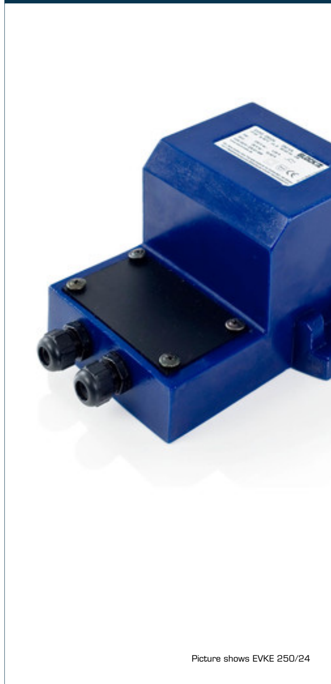
Picture shows EVKE 250/24