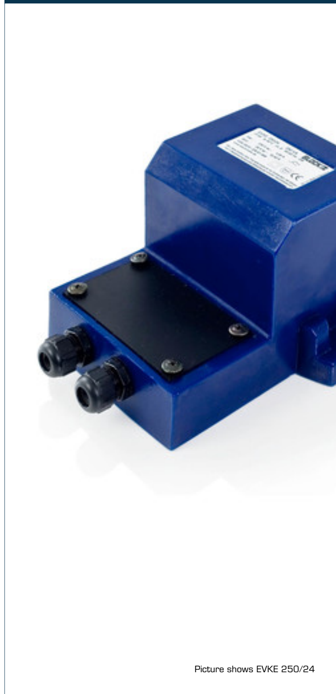
Picture shows EVKE 250/24