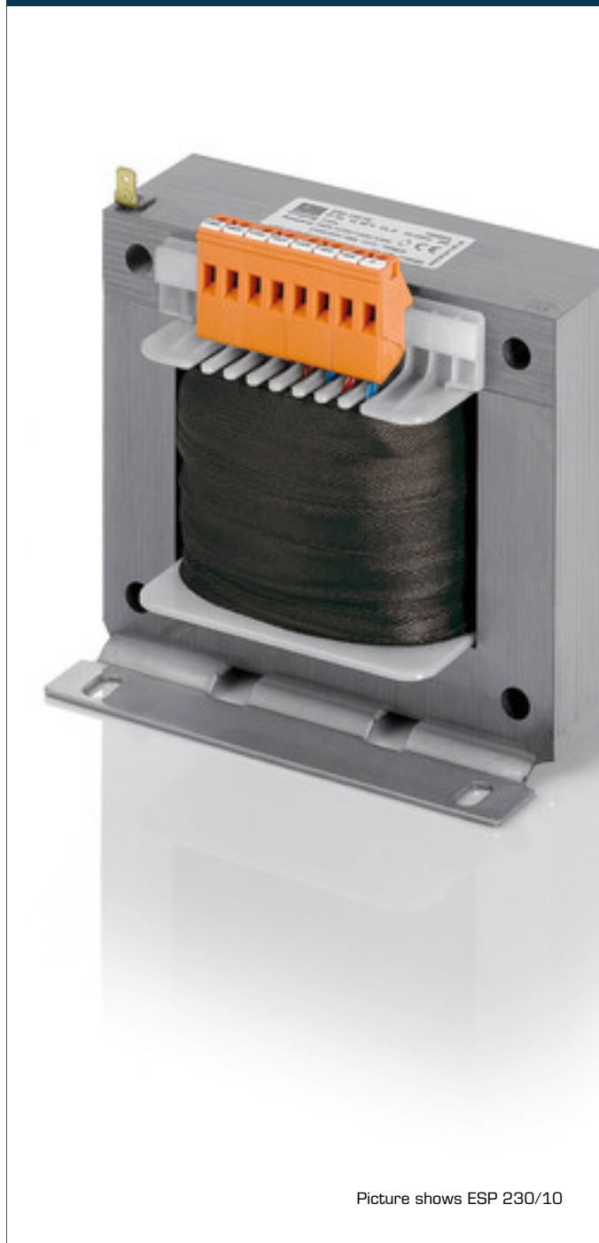
Picture shows ESP 230/10