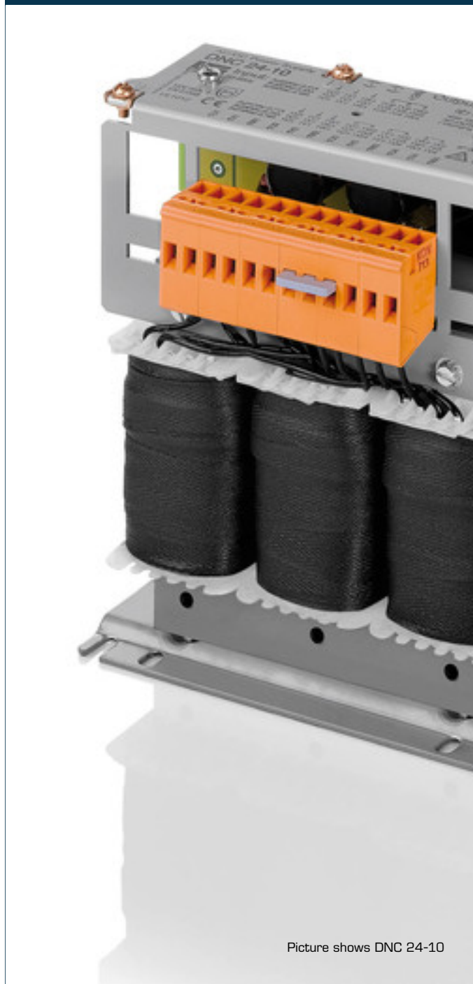
Picture shows DNC 24-10