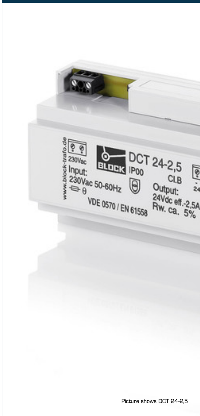
Picture shows DCT 24-2,5