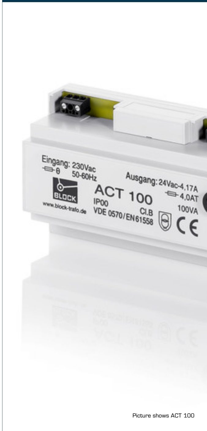
Picture shows ACT 100